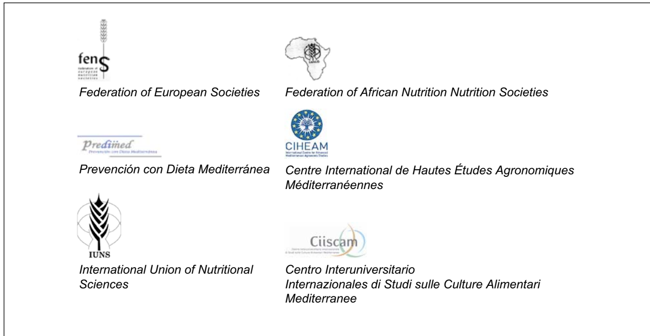
Fig. 3 (Continued)

although needs may vary among people due to age, physical activity, personal circumstances and weather conditions. It should be consumed freely, bottled or from the tap, when hygienic circumstances allow it. In addition to water, sugar-free herbal infusions and tea, and low-sodium and low-fat broths may help to complete the requirements.